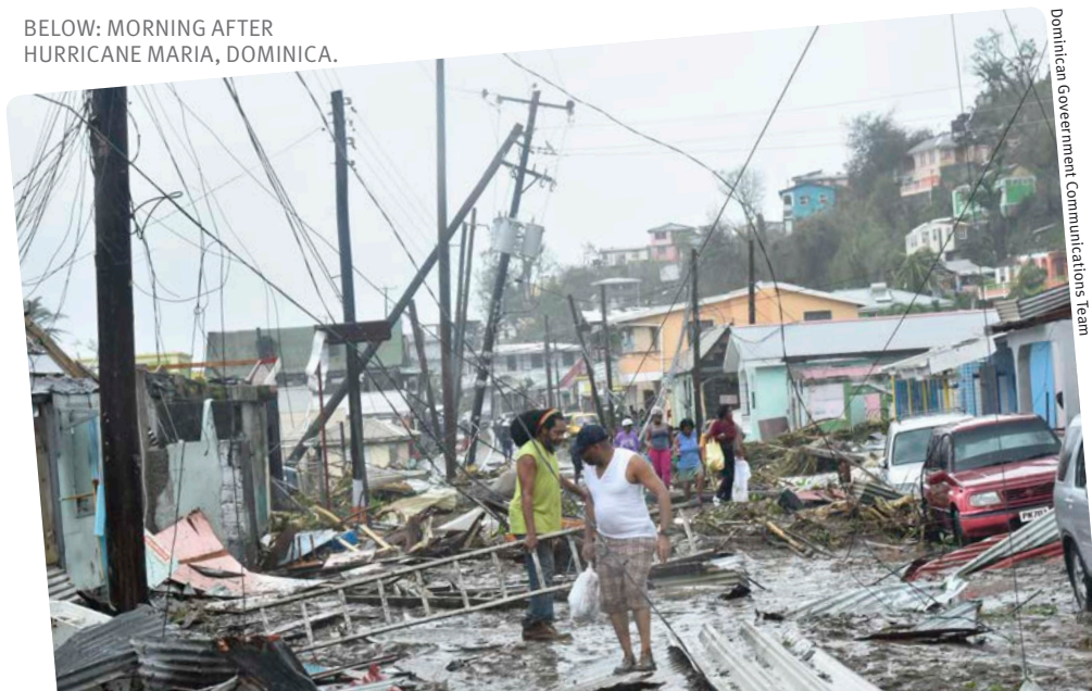
BELOW: MORNING AFTER HURRICANE MARIA, DOMINICA.