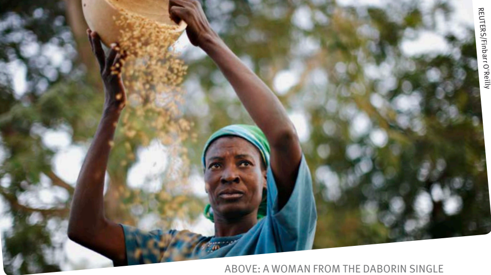
ABOVE: A WOMAN FROM THE DABORIN SINGLE MOTHERS ASSOCIATION WINNOWS RICE AT A SMALL PROCESSING PLANT BOLGATANGA, NORTHERN GHANA

as a result of a lending boom and fall in commodity prices. The situation may worsen further as global interest rates rise. Debt payments are reducing government budgets when more spending is needed to meet the Sustainable Development Goals.”